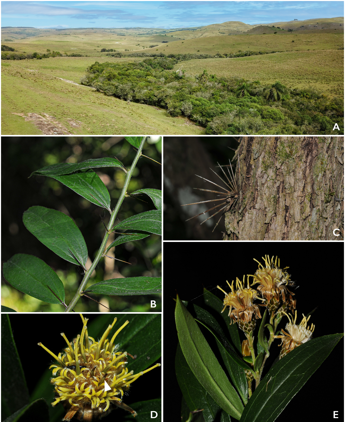
Figure 1. Dasyphyllum spinescens (Less.) Cabrera. A. Habitat in Sierra de Ríos, Cerro Largo, Uruguay. B. Young branch, with spines; notice the distinctive acrodromous venation (a generic distinctive feature). C. Rhytidome and characteristic fasciculate spines. D. Top view of the capitulum; arrow indicates bifid connectival appendage (a generic distinctive feature). E. Side view of capitulescence.